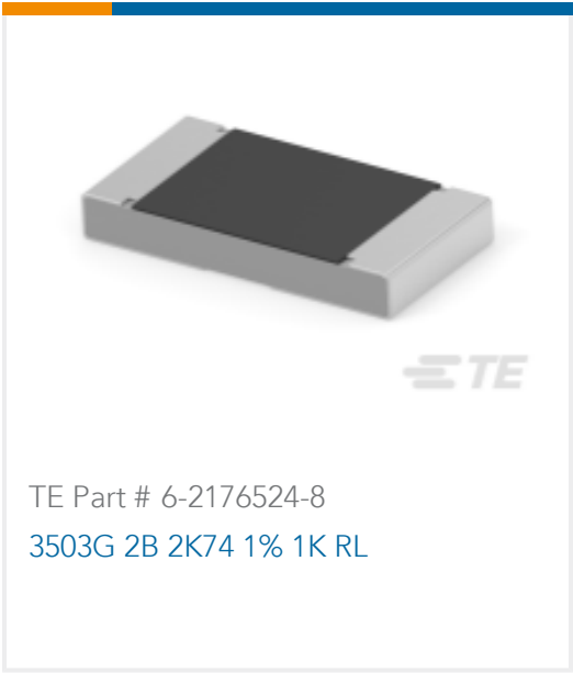
TE Part # 6-2176524-8 3503G 2B 2K74 1% 1K RL