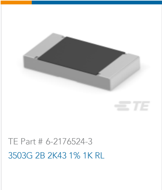
TE Part # 6-2176524-3 3503G 2B 2K43 1% 1K RL