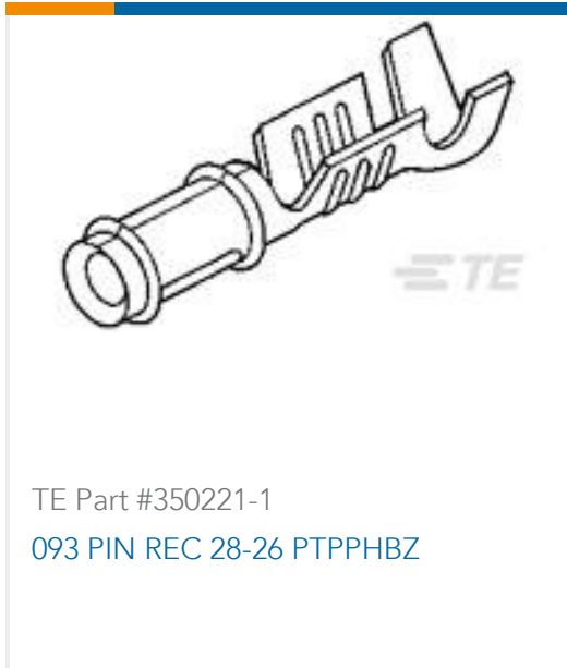
TE Part #350221-1 093 PIN REC 28-26 PTPPHBZ