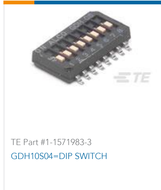
TE Part #1-1571983-3 GDH10S04=DIP SWITCH