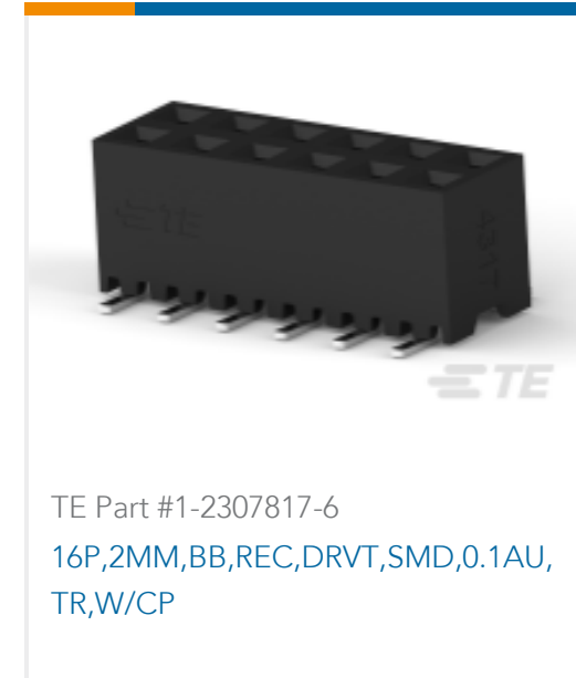
TE Part #1-2307817-6 16P,2MM,BB,REC,DRVT,SMD,0.1AU, TR,W/CP