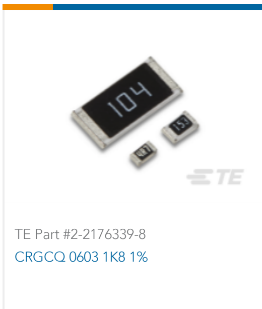
TE Part #2-2176339-8 CRGCQ 0603 1K8 1%