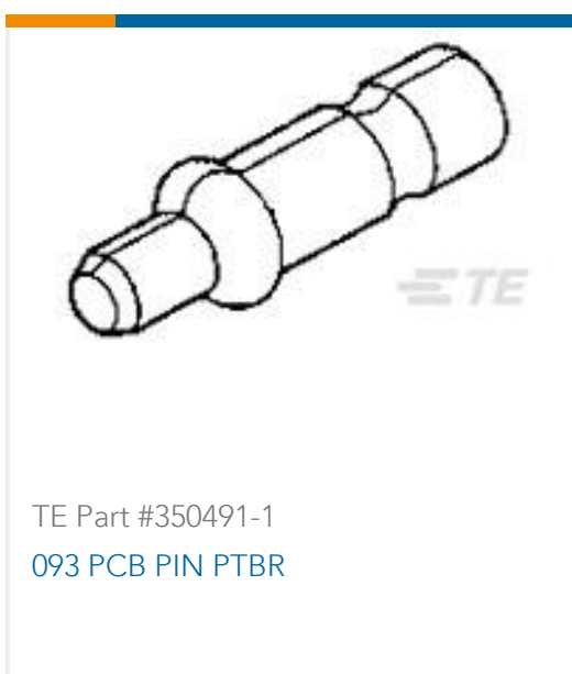
TE Part #350491-1 093 PCB PIN PTBR