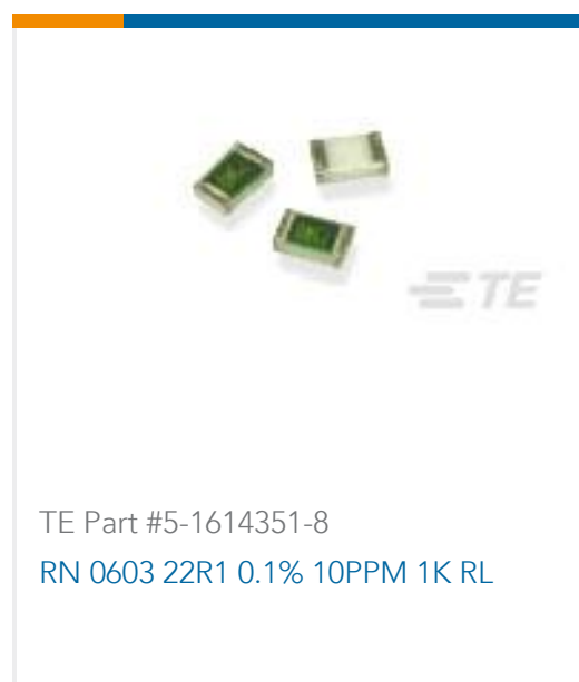
TE Part #5-1614351-8 RN 0603 22R1 0.1% 10PPM 1K RL