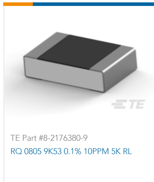
TE Part #8-2176380-9 RQ 0805 9K53 0.1% 10PPM 5K RL