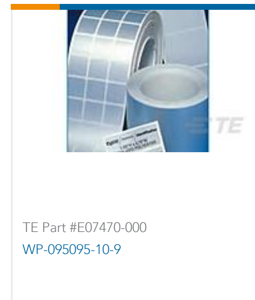
TE Part #E07470-000 WP-095095-10-9