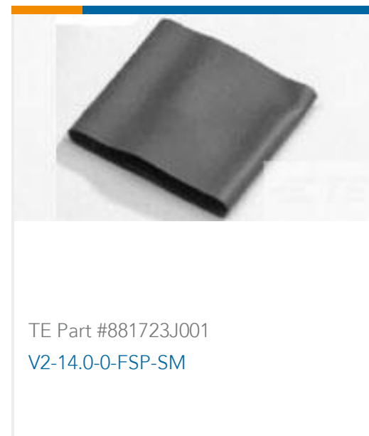
TE Part #881723J001 V2-14.0-0-FSP-SM