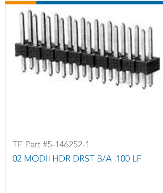
TE Part #5-146252-1 02 MODII HDR DRST B/A .100 LF