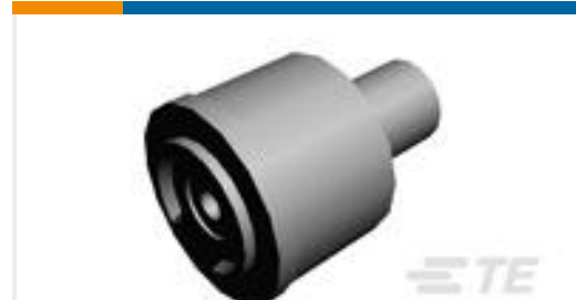
TE Part #284863-1 SINGLE WIRE SEAL F.EXT.INS.DIA