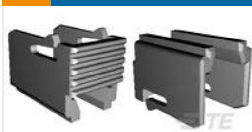
TE Part #965383-1 MQS SICHERGSCHIEBER 8POS