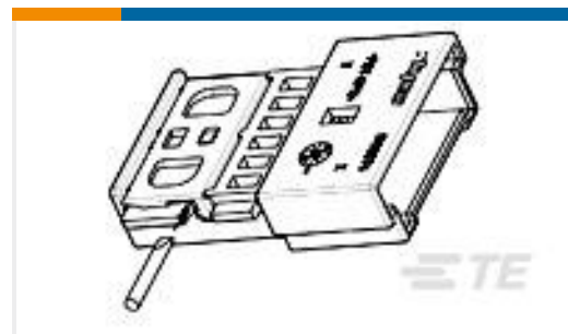
TE Part #1703874-1 6POS MQS REC COD A