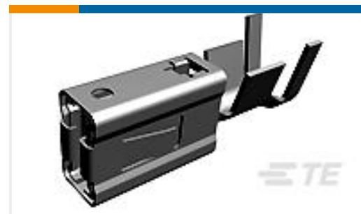
TE Part #1241406-3 AMP MCP 6.3/4.8K, CONTACT