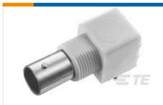
TE Part #1-5227161-7 RTANG JACK W/MTG PINS,BNC PCB