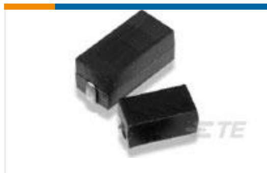
TE Part #1879022-9 SMF3 680R 5%