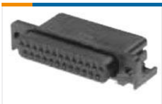
TE Part #5747460-5 HD-20 RCPT 15P RA 590 FFSCRLK