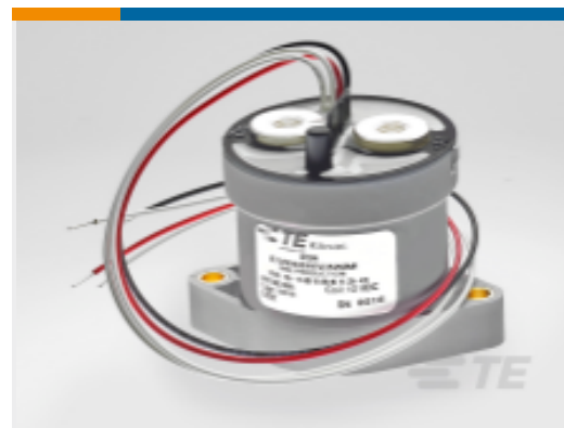
TE Part #4-1618413-9 EV600HSANM = CONTACTOR, SPST- NO 24V COIL