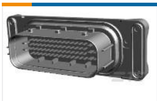
TE Part #2-1418362-1 62 POS MIXED HEADER CODB