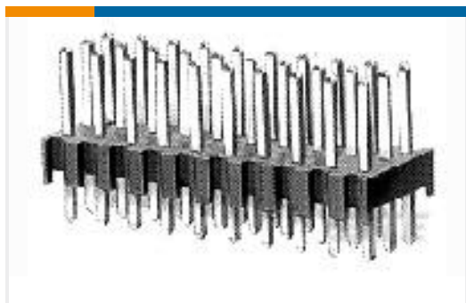
TE Part #5-103817-6 24 MODII HDR 3RST UNSHRD .100