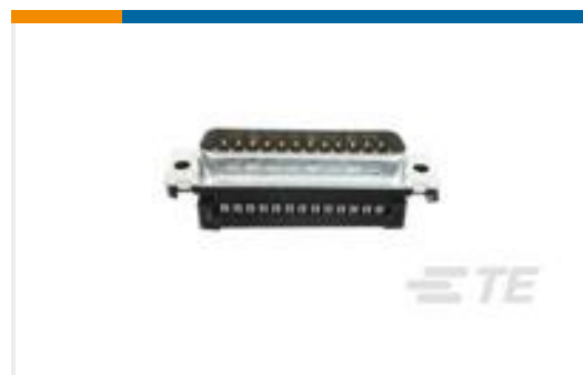
TE Part #1658613-2 25 POS HDF PLUG, MS, LEAD FREE