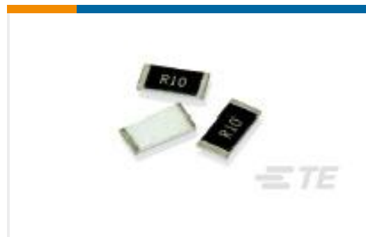
TE Part #2-2176057-4 RLP73N 3A R091 1% 1K RL