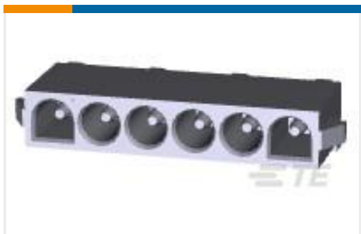
TE Part #641831-1 06P UMNL PIN HDR ASSY 94VO