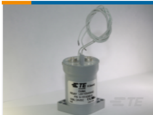
TE Part # 6-1618412-9 LEV100H4ANG=CONTACTOR 12V, AUX SPST,15"