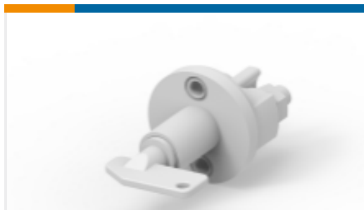
TE Part #K1130128 Battery Disconnecter 35-210-100-R