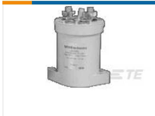
TE Part # 3-1618389-7 LEV100A4ANG=RELAY, 12Vdc SPST-NO