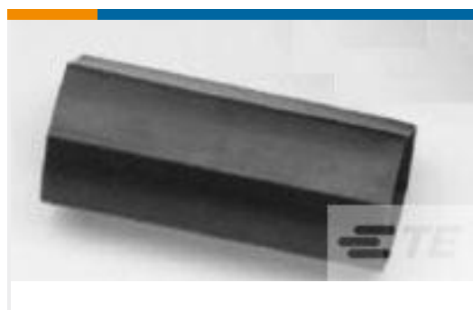
TE Part #CB5147-000 HRSR-175FR-10