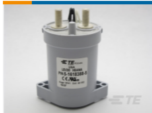
TE Part # 9-1618392-2 LEV200HLANA=RELAY, SPST-NO