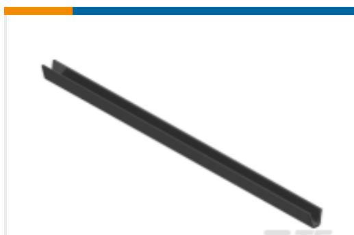
TE Part #7574442007 RAYRIM-NR8-0-STK