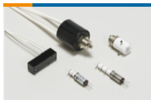
High Voltage Relays(13)