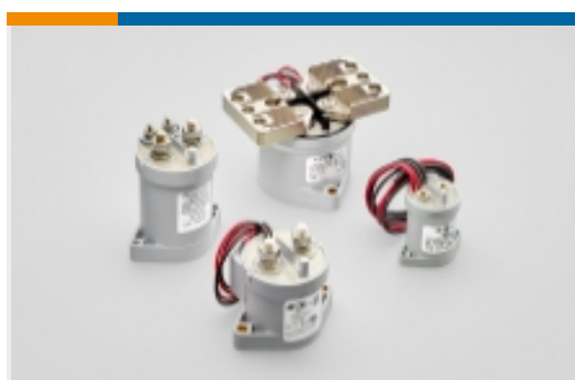
General Purpose Contactors(4)