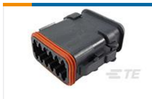
TE Part #DT06-12SB-CE04 PLG, 12P, BLK, E, XCAP, B