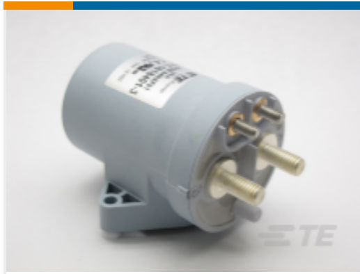
TE Part #3-1618389-2 LEV200H4ANF=RELAY, SPST-NO