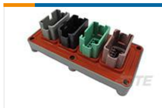
TE Part #DT04-48P-B016 REC, 48P, GRY, N, FLANGE, ABCD