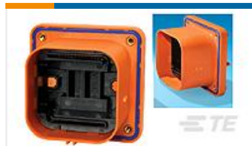
TE Part #1587987-8 RECEPTACLE ASSEMBLY, 200A, MSD