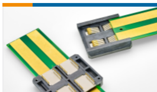
TE Part #2204740-1 75A/POLE, DUAL POLE SLIDING POWER CONN