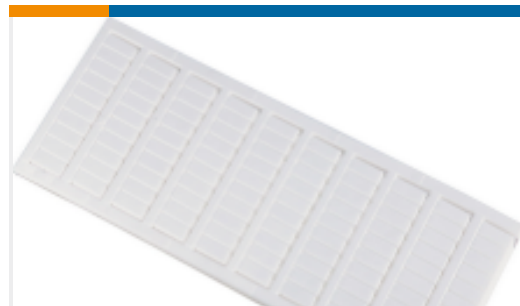
TE Part #1SNK150021R0000 MC612PA 11->20 (x10) Horizontal