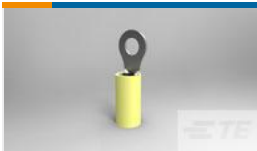
TE Part #2-36161-5 TERMINAL,PIDG R IR 12 6