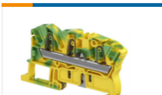
TE Part #1SNK706151R0000 ZK4-PE-3P