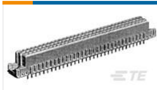
TE Part #535090-4 096 EURO TYPE C RECEPT ST ASSY