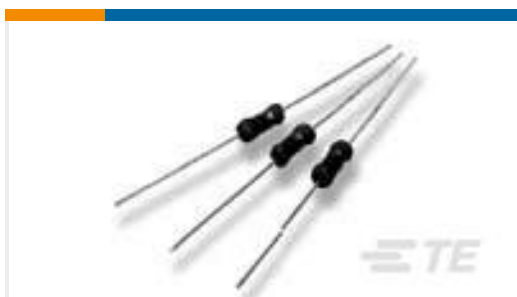
TE Part #7-1625890-0 2W SM M/OX 5% 82K