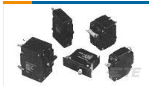
TE Part #6-1393252-1 W67-X2Q12-30=M6/M7/M9/W6/W7