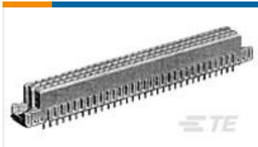
TE Part #535090-4 096 EURO TYPE C RECEPT ST ASSY