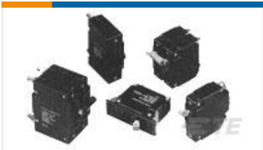
TE Part #6-1393252-1 W67-X2Q12-30=M6/M7/M9/W6/W7