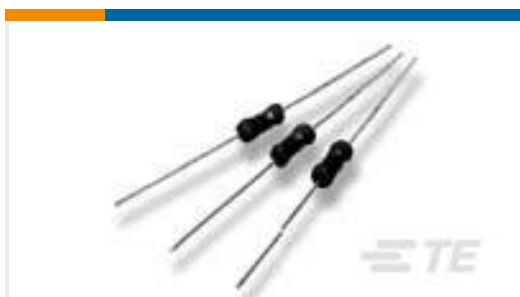
TE Part #7-1625890-0 2W SM M/OX 5% 82K