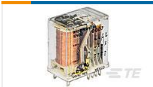
TE Part #1-1393767-5 R10-E2X2-V700=R10