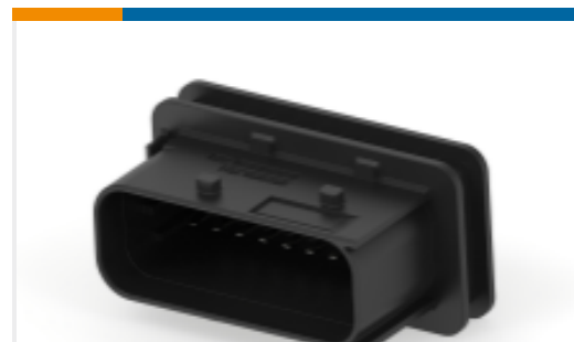
TE Part #1-2369516-1 18POS,TAB1.6X0.6,HDR ASSY, 180DEG,COD A