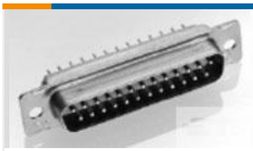
TE Part #1757823-8 AMPLIMITE,ASY,PLUG,STD,90,ZN,2,CT