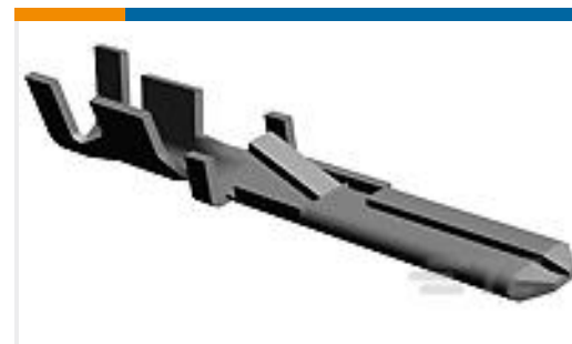
TE Part #928781-2 FF 110 TAB 1.0-2.5 MM2 PTP CUZN30