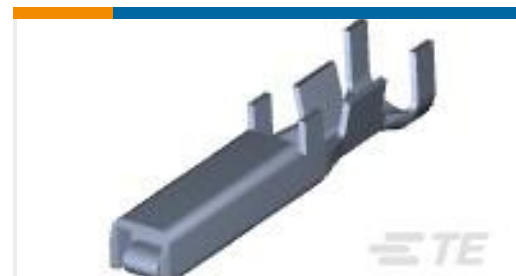
TE Part #1-175218-5 DYNAMIC D-3 REC CONT. L PRE-TIN L/P