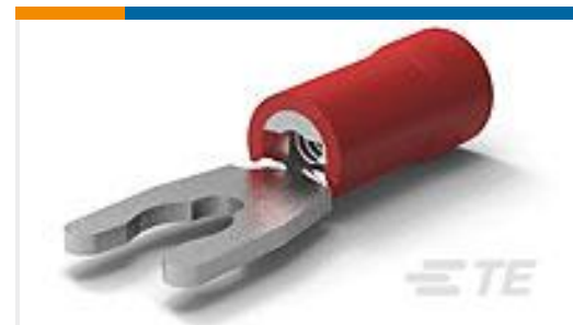
TE Part #52949 PG SPR SPD 22-16COMM 22-18MIL6