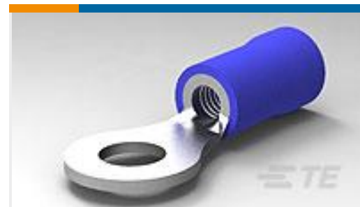
TE Part #34160 TERMINAL,PG R 16-14 8