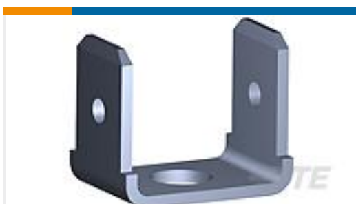
TE Part #41619 250 FASTON TAB BR