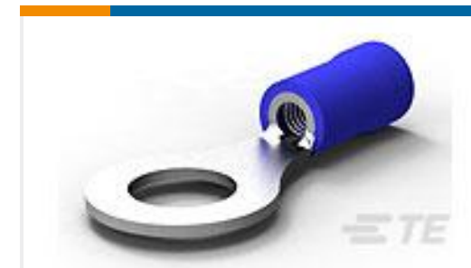
TE Part #34162 TERMINAL,PG R 16-14 1/4