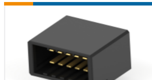
TE Part #1-178313-5 Header Assembly: Wire-to-Board, 15A, gold or tin plated