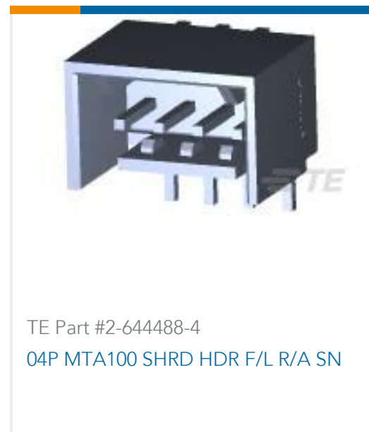
TE Part #2-644488-4 04P MTA100 SHRD HDR F/L R/A SN