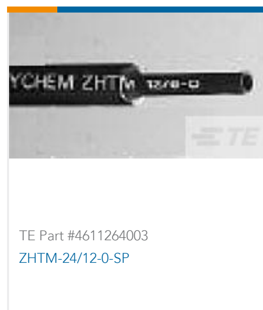
TE Part #4611264003 ZHTM-24/12-0-SP