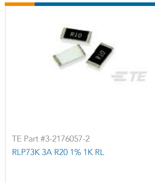
TE Part #3-2176057-2 RLP73K 3A R20 1% 1K RL