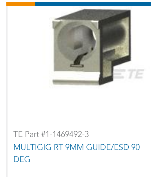
TE Part #1-1469492-3 MULTIGIG RT 9MM GUIDE/ESD 90 DEG