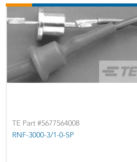
TE Part #5677564008 RNF-3000-3/1-0-SP