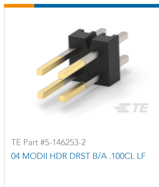
TE Part #5-146253-2 04 MODII HDR DRST B/A .100CL LF