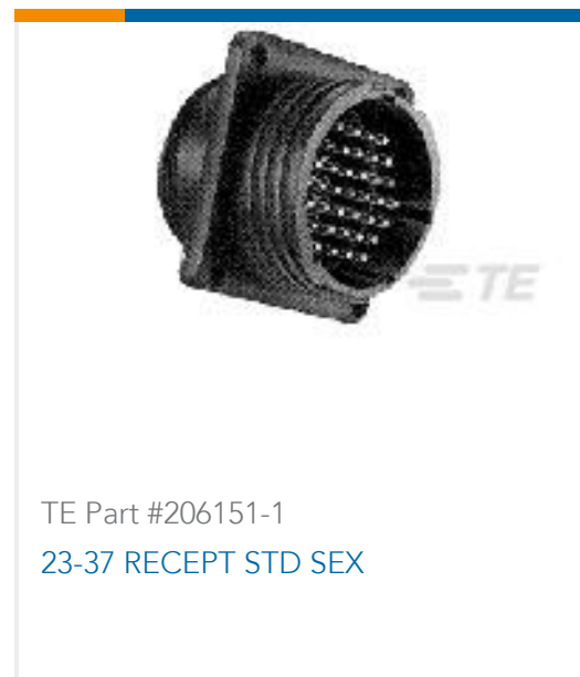
TE Part #206151-1 23-37 RECEPT STD SEX