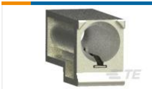
TE Part #1-1469492-9 MULTIGIG RT 9MM GUIDE/ESD UNKE