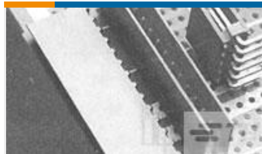
TE Part #281698-6 HEADER HE14 RA 6 P