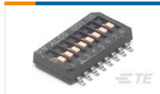
TE Part #1571983-4 GDH04S04=DIP SWITCH