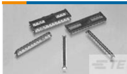
TE Part #3-1827231-6 .5FHR04H,440,B,GIG,08/Sn,HT,NS