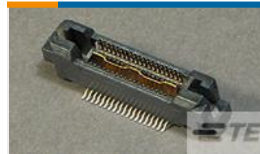
TE Part #5767007-8 MICT,260PLUG,38,ASSY,.025,REC