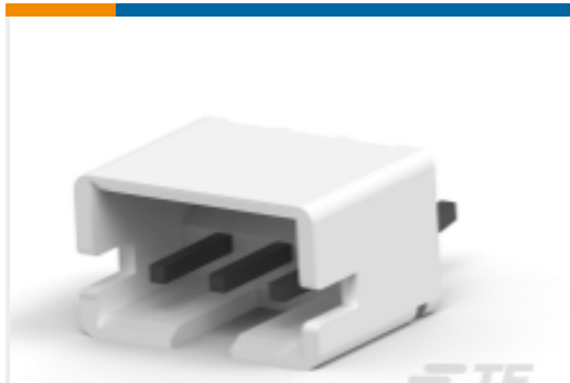
TE Part #440054-3 AMP HPI 2.0 mm Headers