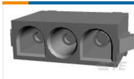
TE Part #350825-1 03P UMNL HDR ASSY PC 94VO