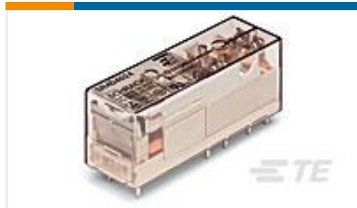
TE Part #3-1415054-1 SR4M4048