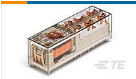
TE Part #9-1415018-1 SR6A4110 - V23050-A1110-A533