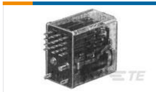
TE Part #5-1393766-5 R10-E1Y4-V2.5K=R10