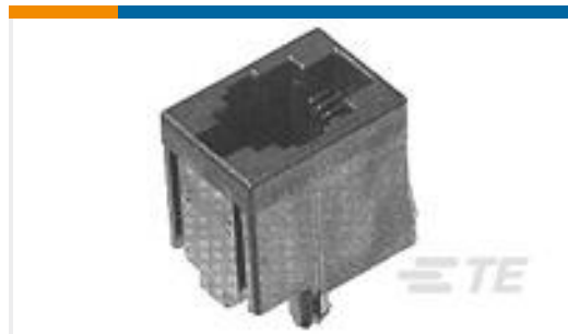
TE Part #5558872-1 MJ,TE,4P,W/O PNL STOPS