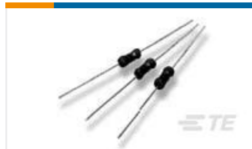
TE Part #4-1625892-7 3W SM M/OX 5% 3K3