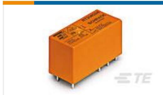
TE Part #7-1393238-7 RTD14730