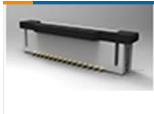
TE Part #1734248-4 1.0 FPC, ZIF V/T, SMT, 4P