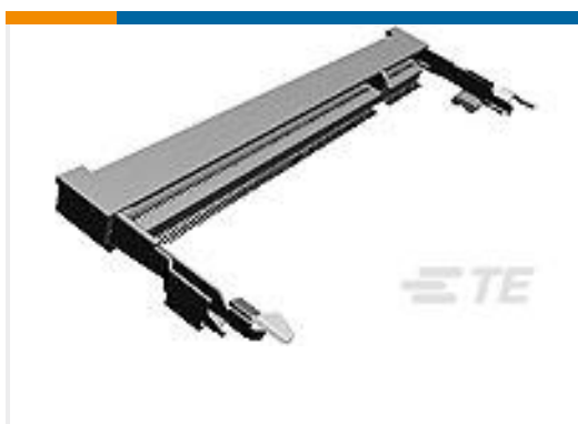
TE Part #1565917-4 EMBOSS ASSY DDR2 SODIMM SOCKET 200P 5.2H