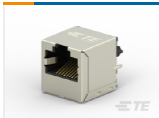
TE Part #5-2301995-1 RJ45 JACK INT.MAG. 1GB 1X1 VERT.