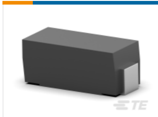
TE Part #6-2176459-1 SMW 7W 33R 5% Taped