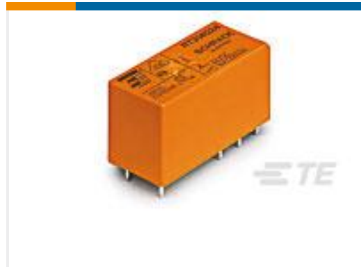
TE Part #7-1393243-8 RT424615