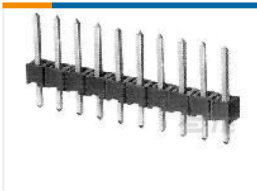
TE Part #826926-5 5P AMPMODU II STIFT LEI