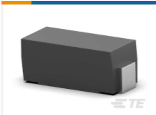
TE Part #2-2176460-8 SMF 7W 15K 5% Taped