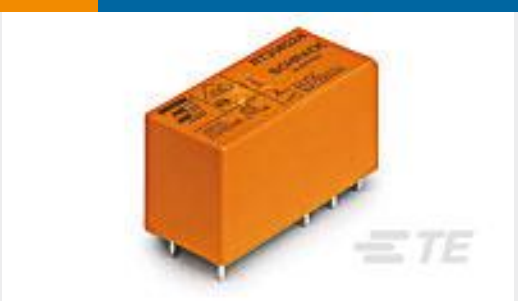
TE Part #8-1393243-2 RT425012