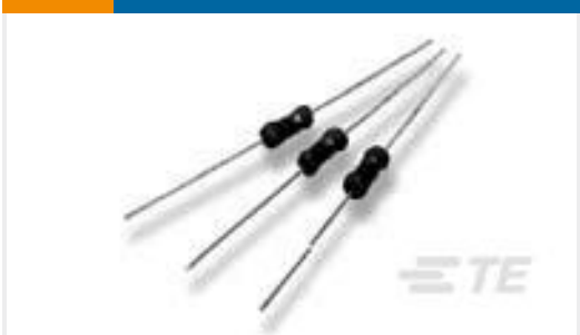
TE Part #3-1625892-8 3W SM M/OX 5% 2K7