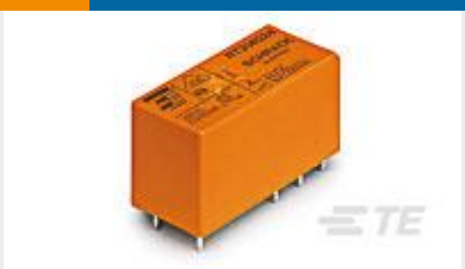
TE Part #9-1393239-8 RT314024