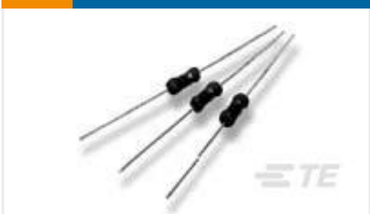
TE Part #3-1625890-0 2W SM M/OX 5% 220K