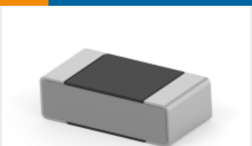
TE Part #1-1879125-5 RN 0402 56R2 0.1% 10PPM 5K RL