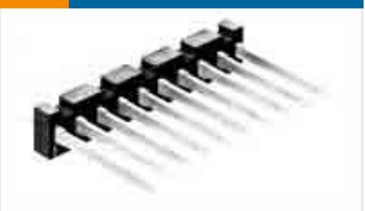
TE Part #2-826576-0 20P MOD 1 UNSHROUDED HEADER, ST, TIN