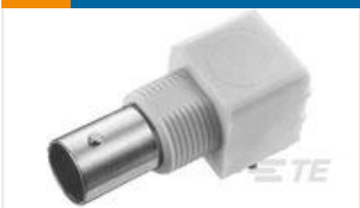
TE Part #5227161-9 RTANG JACK W/MTG PINS,BNC PCB