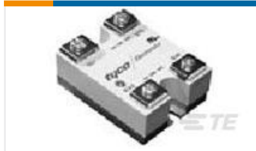
TE Part #2-1393030-9 SSR-480D125= PANEL MNT,125A, 600VAC-DC i/p