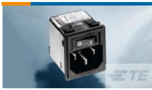
TE Part #2-1609114-1 15CUFS1=F8302