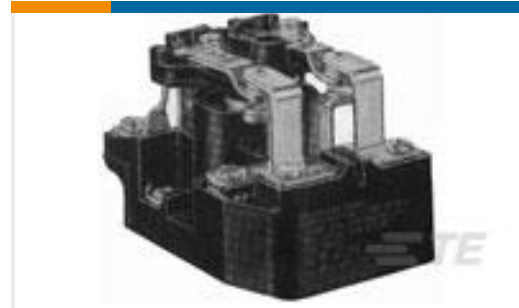
TE Part #2-1393127-9 PRD-11AY0-24=PRD