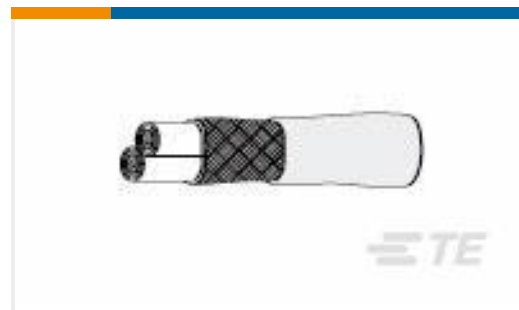
TE Part #382825-000 44A1121-16-2/6-9