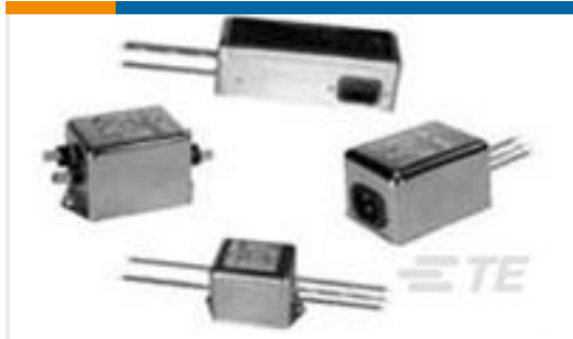
TE Part #6609049-1 3VQ1=F7265 S0