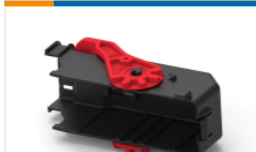
TE Part #1924779-1 WIRE DRESS ASSY, 96P GPEC II