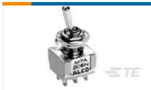
TE Part #1-1437558-1 MTA106DPC=(MSTA) SW TOG P/C TE