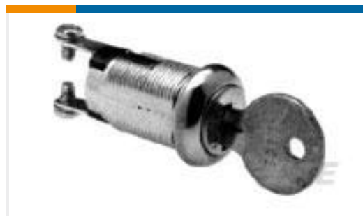
TE Part #1-1437597-7 2SWK131AL101=NON UL KEYLOCK SW