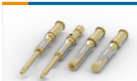
TE Part #200333-8 Pin and Socket Contacts, Type II