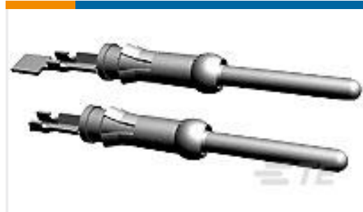
TE Part #66099-2 III+ PIN,18-16,TIN-LEAD,LP