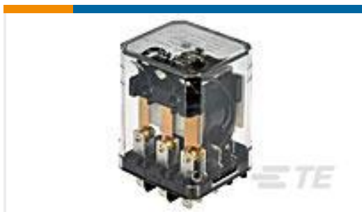
TE Part #8-1393116-4 KUMP-14A18-120=KU