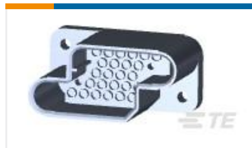
TE Part #211149-1 PIN HSG,25 POSN,METRIMATE