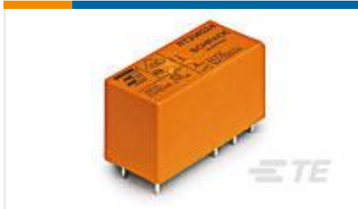
TE Part #1393240-6 RT314615