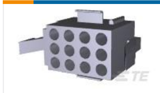
TE Part #1-480275-0 12P CMNL PLUG HSG P/M NATL