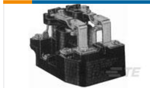
TE Part #4-1393127-6 PRD-11DH0-110=PRD