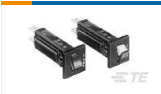
TE Part #3-1393250-4 W28-XQ1A-3=W28-