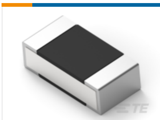
TE Part #2176308-9 RP 1E 0.1W 162K 0.1% 25PPM 5K RL