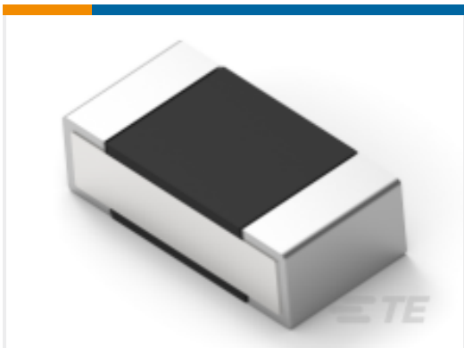
TE Part #9-2176307-1 RP 1E 0.1W 107K 0.1% 25PPM 5K RL