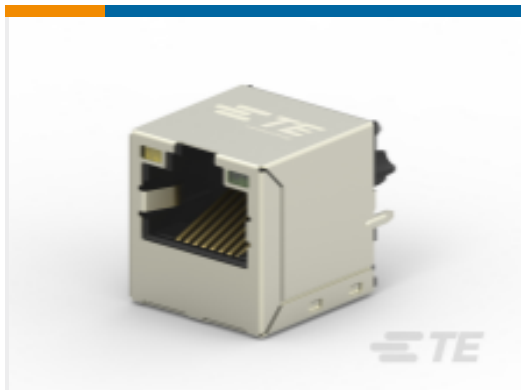
TE Part #5-2301995-3 RJ45 JACK INT.MAG. 10/100 LED 1X1 VERT.