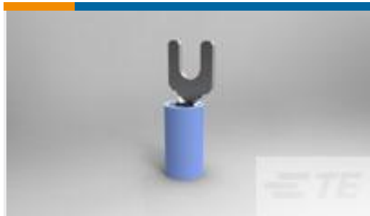
TE Part #35559 TERMINAL,PIDG SPD 16-14 6