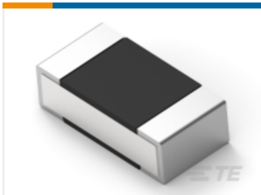
TE Part #9-2176307-3 RP 1E 0.1W 113K 0.1% 25PPM 5K RL