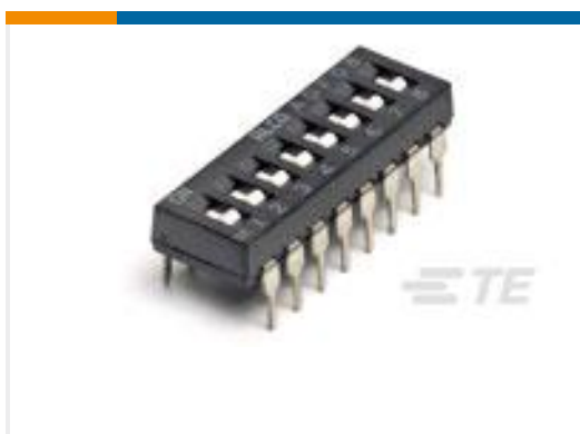
TE Part #1825002-1 ADF0204=DIP SWT,FLUSH,THRU/HL