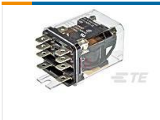
TE Part #6-1393114-5 KUHP-11AT1-120=KU