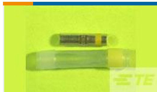
TE Part #650075N003 D-436-37CS454