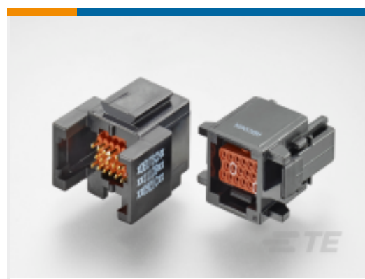
TE Part #ABC06N-22P-4048 IN-LINE PLUG