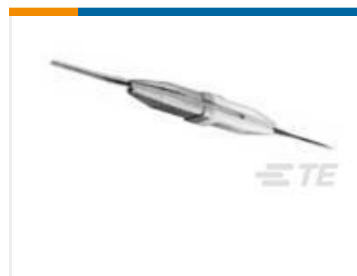
TE Part #91067-1 INSERTION/EXTRACTION TOOL