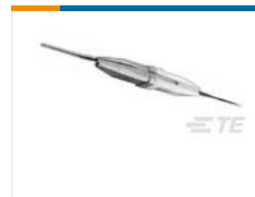
TE Part #91066-4 INSERTION/EXTRACTION TOOL