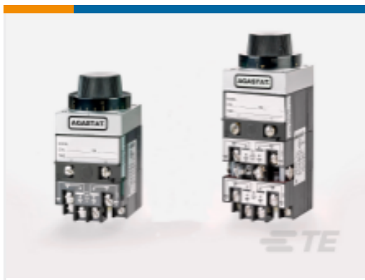
TE Part #1423158-1 7012L10BN=RLY,NAV,ON,2P,440VA