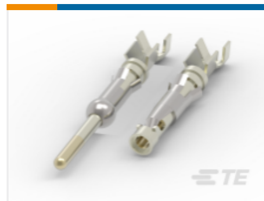
TE Part # CAT-AM71-T98B Strip Pin and Socket Contacts, Type III