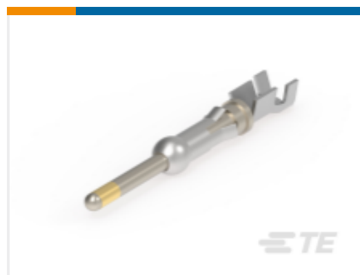
TE Part # 66099-1 III+ PIN, 18-16, 30AU > 10, LP