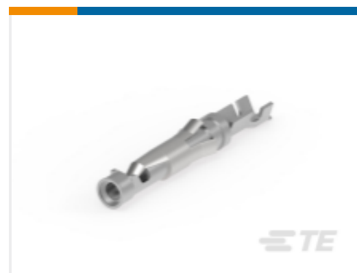
TE Part # 66105-2 III+ SKT, 24-20, TIN-LEAD, LP