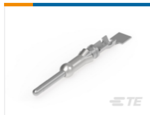
TE Part # 66103-2 III+ PIN, 24-20, TIN-LEAD, LP