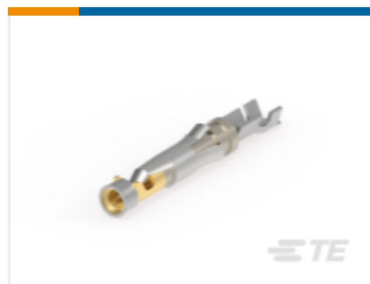
TE Part # 1-66105-8 III+ SKT, 24-20, 30AU/FL, SMPACK