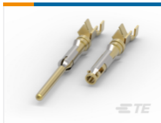
TE Part # CAT-AM71-T98D Pin and Socket Contacts, Type III, LP EMEA