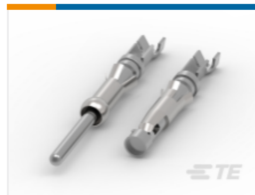
TE Part # CAT-AM71-T98C Strip Pin and Socket Contacts, Type III, EMEA