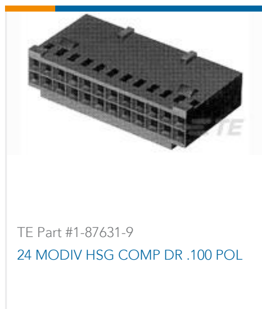
TE Part #1-87631-9 24 MODIV HSG COMP DR .100 POL