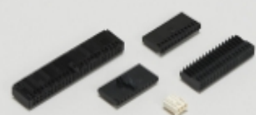
Wire-to-Board Connector Assemblies & Housings(27)