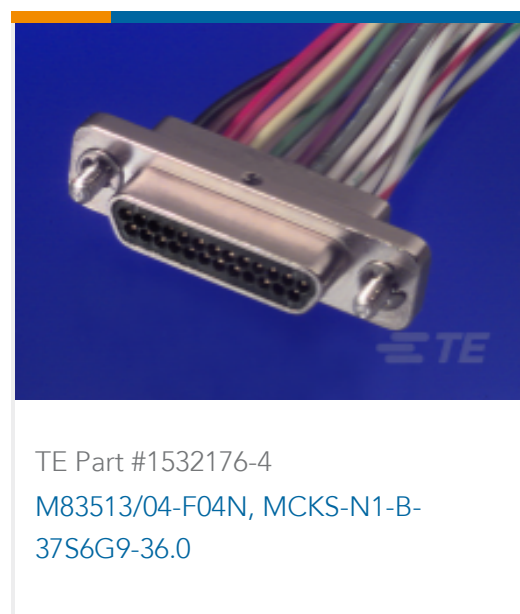
TE Part #1532176-4 M83513/04-F04N, MCKS-N1-B-37S6G9-36.0