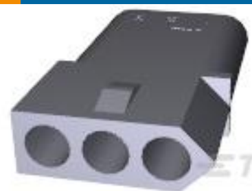
TE Part #770070-1 03P .093 COMM P&S RECPT HSG