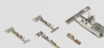
Wire-to-Board Connector Contacts(15)