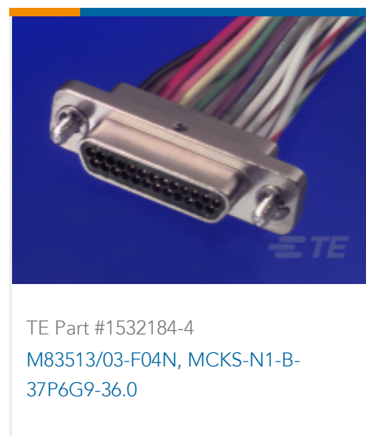
TE Part #1532184-4 M83513/03-F04N, MCKS-N1-B-37P6G9-36.0