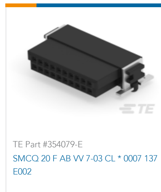
TE Part #354079-E SMCQ 20 F AB VV 7-03 CL * 0007 137 E002