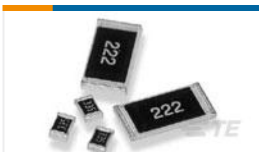
TE Part #6-1622826-4 CRG0402 ZEROHM