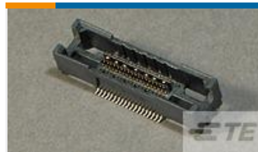
TE Part #2-5767004-2 MICTOR RECEPT ASSY, 38 POS.