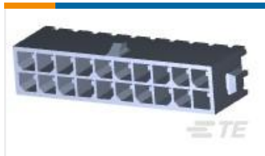
TE Part #5-794630-0 20P MICRO MNL ASSY,VRT,HDR,LF