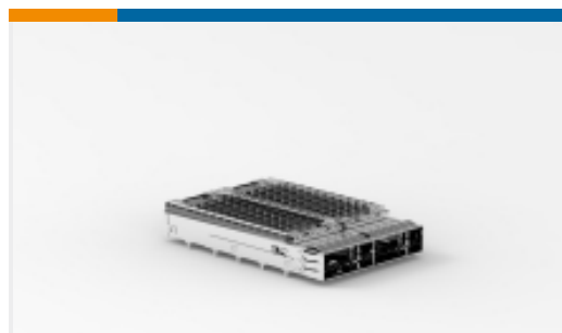
TE Part #2170806-1 CAGE ASSEMBLY, 1X2, QSFP28, SPRING, HS