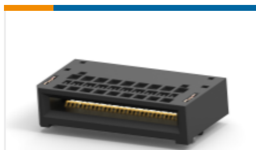
TE Part #2327672-1 RECEPT ASSY, RA, 56 POS, SLIVER 2.0