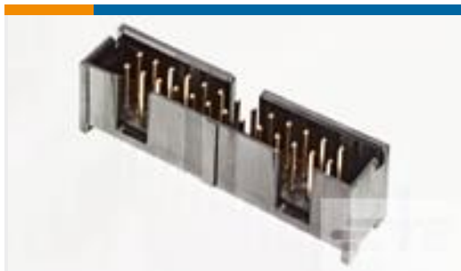
TE Part #2-1761603-5 IDC LOW PRO HDR 14P VERT BLUE