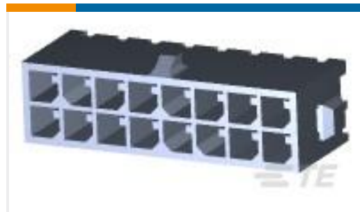
TE Part #4-794630-6 16P MICRO MNL ASSY,VRT,HDR,LF