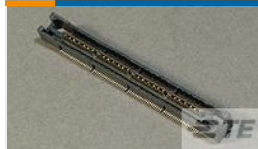
TE Part # 5767114-4 MICT,REC,152,ASY,.025,TAPE,CAP