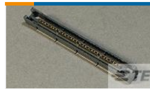
TE Part # 5767096-4 MICT,REC,152,ASY,.025,TAPE PKG