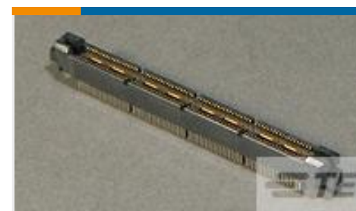
TE Part #5767006-4 MICT,R/APLUG,152,ASY,.025,.062