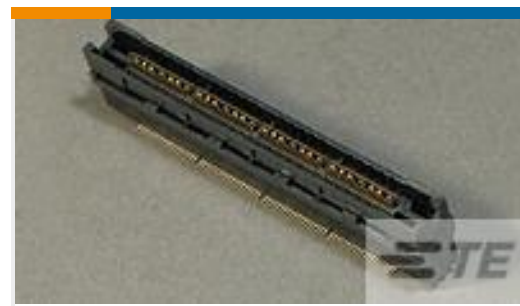
TE Part # 5767094-4 MICT,RECPT,152,ASY,PDNI,EXTD