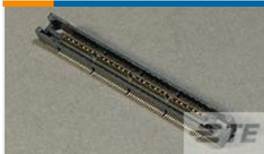
TE Part # 5767110-4 MICT,RECPT,152,ASSY,.025