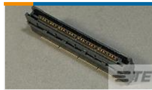
TE Part # 5767095-4 MICT,REC,EXT,152,ASY,PDNI,025