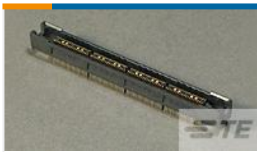
TE Part # 5767089-4 MICTOR,R/A,RECPT,.093,152,ASY