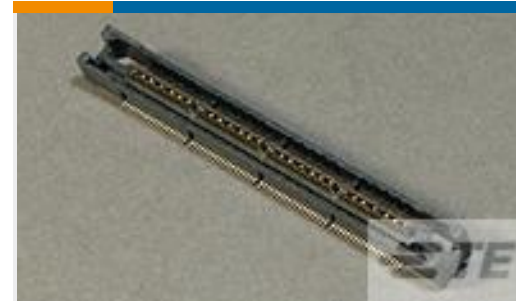
TE Part # 5767115-4 MICT,REC,152,ASY,.025 TAPE PKG