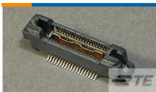
TE Part #5767056-1 MICT,260,PLUG,38,ASSY,PDNI