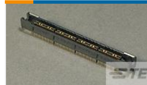
TE Part # 5767143-4 MICT,R/A,RCPT,152,ASY,062,30AU