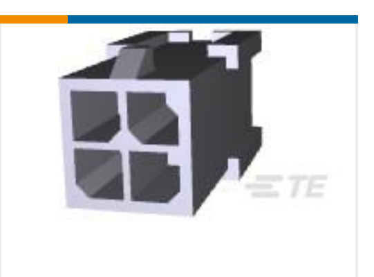
TE Part #794616-4 FREE HANG DBL ROW HSG 4 POS