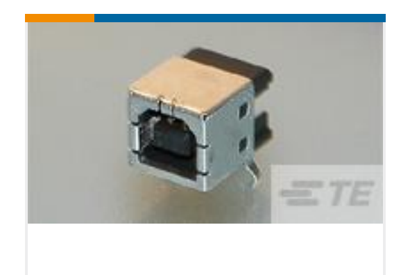
TE Part #292304-1 STD USB TYPE B, R/A, T/H