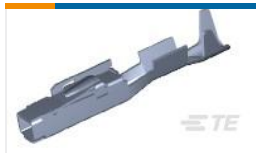
TE Part #7-1452653-2 MCON 1.2 LL REC SRC AU