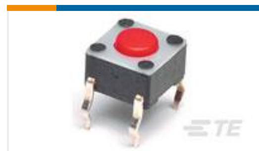
TE Part #3-1825910-1 FSM16JH=6MM TACT SWITCH, HIGH TEMP