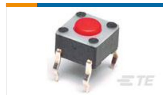
TE Part #2-1825910-7 FSM14JH=6MM TACT SWITCH, HIGH TEMP