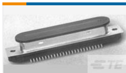
TE Part #553444-5 PLUG ASSY,ACTION PIN,CHAMP-LOK