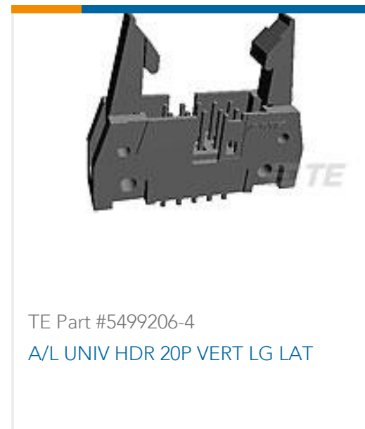
TE Part #5499206-4 A/L UNIV HDR 20P VERT LG LAT