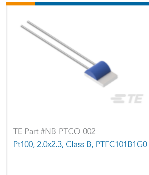
TE Part #NB-PTCO-002 Pt100, 2.0x2.3, Class B, PTFC101B1G0