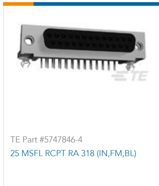
TE Part #5747846-4 25 MSFL RCPT RA 318 (IN,FM,BL)