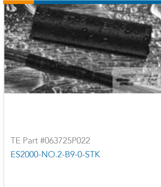
TE Part #063725P022 ES2000-NO.2-B9-0-STK