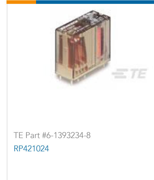
TE Part #6-1393234-8 RP421024