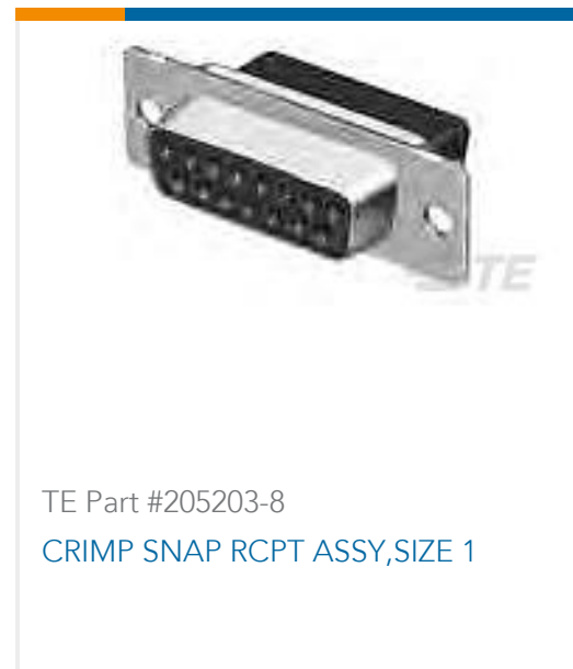
TE Part #205203-8 CRIMP SNAP RCPT ASSY,SIZE 1