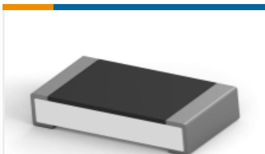
TE Part #2176388-3 RQ 1206 10R5 0.1% 10PPM 5K RL