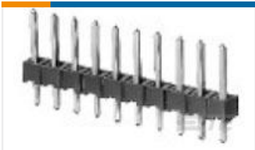
TE Part #9-146284-0 40 MODII HDR SRST B/A .100CL