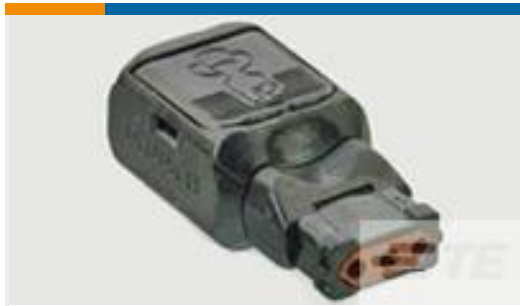
TE Part #D369-R33-NS1 369 3 WAY REC, CRIMP, SKT