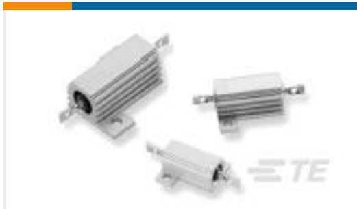
TE Part #1-1879073-3 THS10 2R0 5%