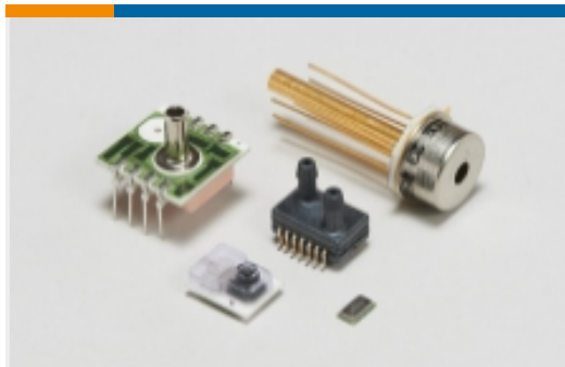
Board Mount Pressure Sensors(10)