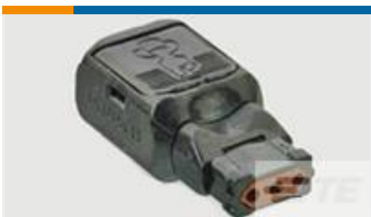
TE Part #D369-P33-NP1 369 3 WAY PLUG, CRIMP, PIN