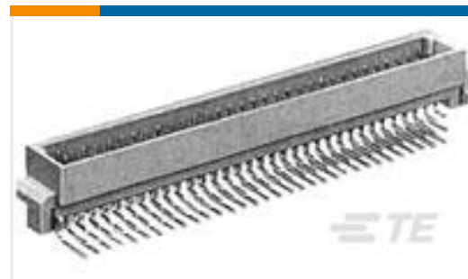
TE Part #5650473-5 ASSY,PIN,EUROCARD,TYPE C,LEAD-