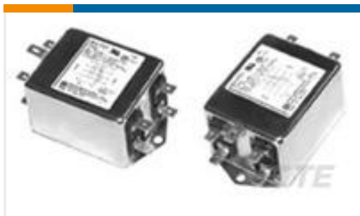
TE Part #6609066-4 20AYO1=F7694 S0