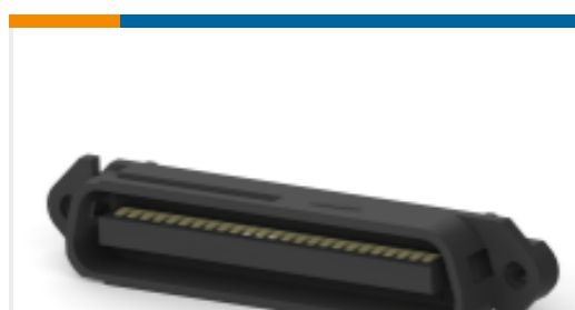
TE Part #552270-1 IDC D-Sub: Plug Assembly, Signal, Cable to Cable, 2.16 mm