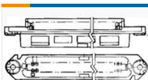
TE Part #2-552001-1 ASSY, RCPT, 50 POS, B SLOT