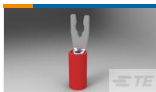
TE Part #52928 PIDG SPRSPD 22-16COM22-18MIL 5