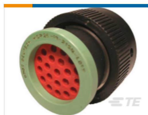
TE Part #HDP26-18-21SN-L017 PLG, 21P, BLK, N, RNG, 20, S