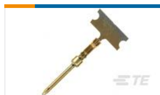
TE Part #5066682-6 CONT,PIN,PLATED,20DF,STRIP,#24-28