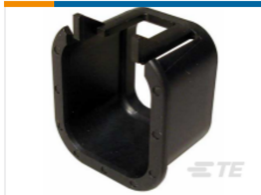
TE Part #1011-086-0605 SEAL RET, 6P, BLK, DTM