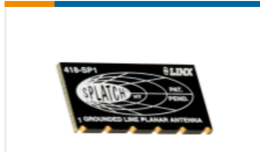
TE Part #ANT-418-SP Antenna SP PCB RPC 418MHz SMT