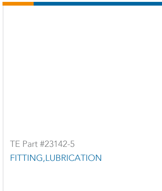
TE Part #23142-5 FITTING,LUBRICATION