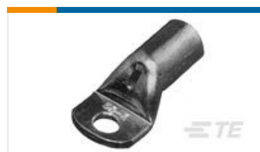
TE Part #710026-5 XCT 25-8