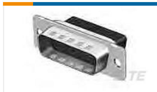
TE Part #5745036-2 PLUG ASSY,25P,HDP-20,CN