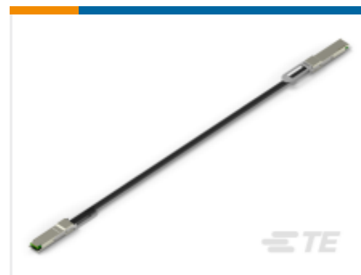
TE Part #2333393-6 QSFP 25GIG 30AWG 2.5 METER