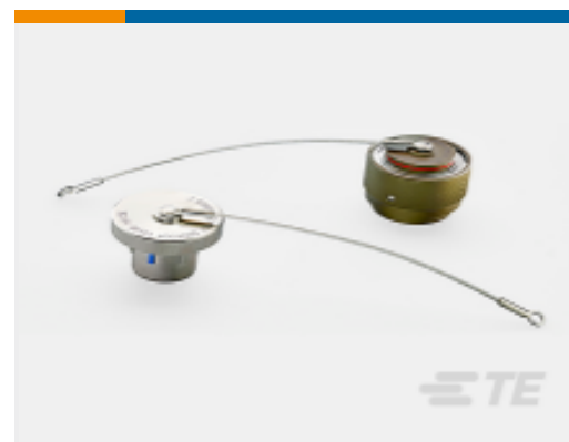
TE Part #YDIV52W15RV0010000 CAP ASSEMBLY, PLUG