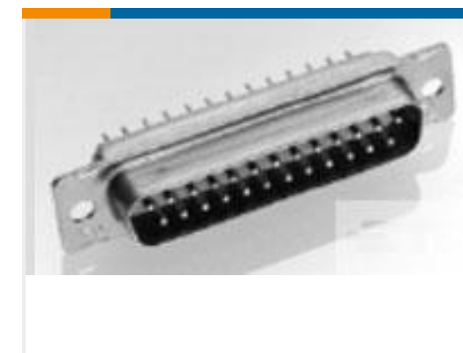
TE Part #205556-2 AMPLIMITE,ASY,PLUG,STD,109,1