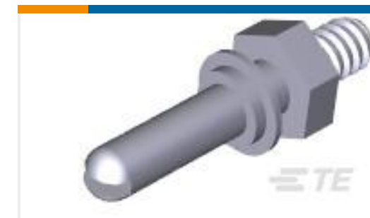
TE Part #1-201046-2 SERIES "M" MIN RECT GUIDE PIN