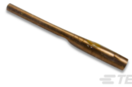
TE Part #543382-5 INSERT/EXTRACT TIP 25-KIT