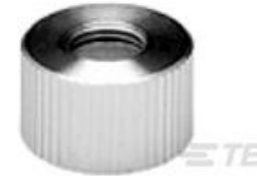
TE Part #8-1437627-2 G12B=BUTTON GUARD BLACK