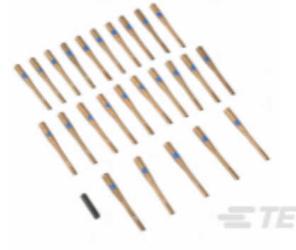
TE Part #543382-6 INSERT/EXTRACT TIP 25-KIT