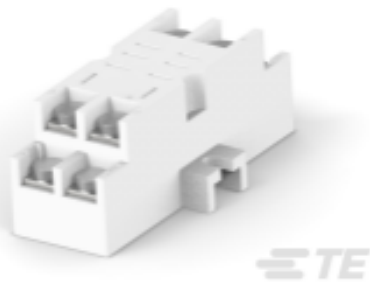
TE Part #1-1419106-9 27E487=SOCKET,K10,8,SCW,PHEN,G