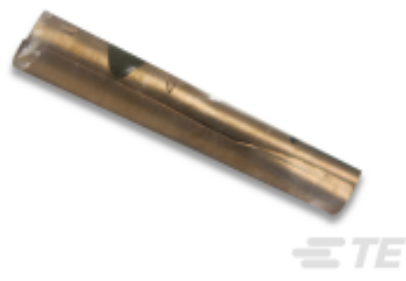
TE Part #1-543382-1 INSERT/EXTRACT TIP 25-KIT