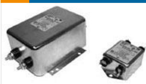
TE Part #1-6609037-4 15EMC1=F8129