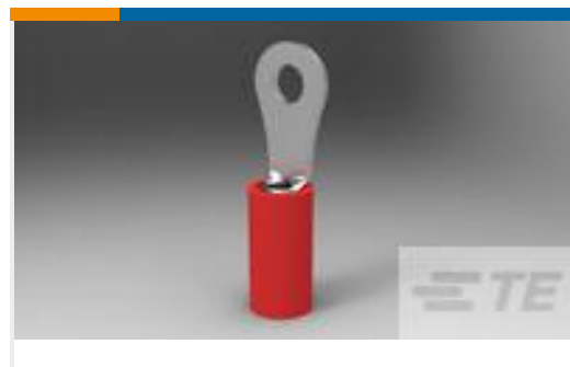
TE Part #2-320553-2 PIDG R 22-16 COMM 22-18 MIL 4