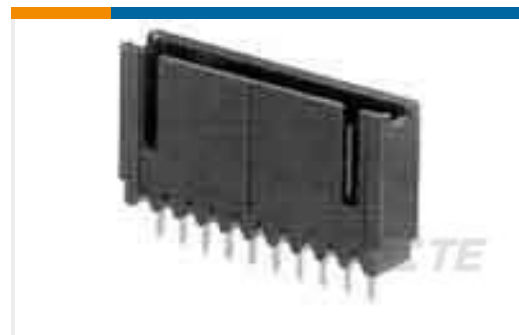
TE Part #5-103080-1 03 MODII HDR SRST SHRD .100CL