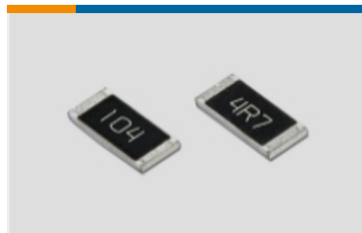
Surface Mount Resistors(554)