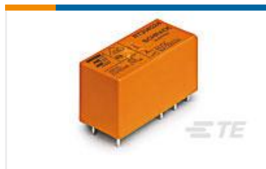
TE Part #1415898-4 RTS3TF03