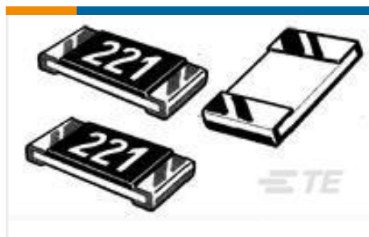
TE Part #3-1622820-5 3520 2R7 5%