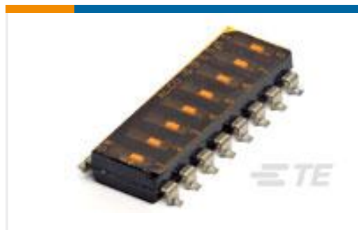
TE Part #1825006-7 GDS04S04=DIP SW,SLIDE,SMT