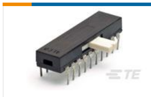
TE Part #1-1825010-8 ASE42L04=4PDT AUTOSLIDE