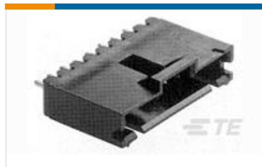
TE Part #5-104362-1 02 MTE HDR SRST LATCH W/HLDWN