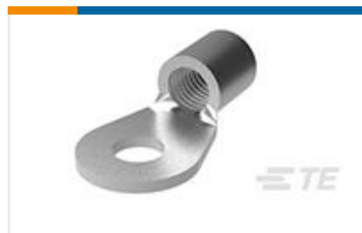
TE Part #33460 TERMINAL,SOLIS R 8 10