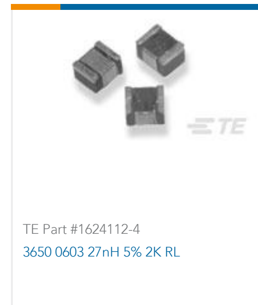
TE Part #1624112-4 3650 0603 27nH 5% 2K RL