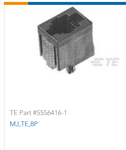
TE Part #5556416-1 MJ,TE,8P