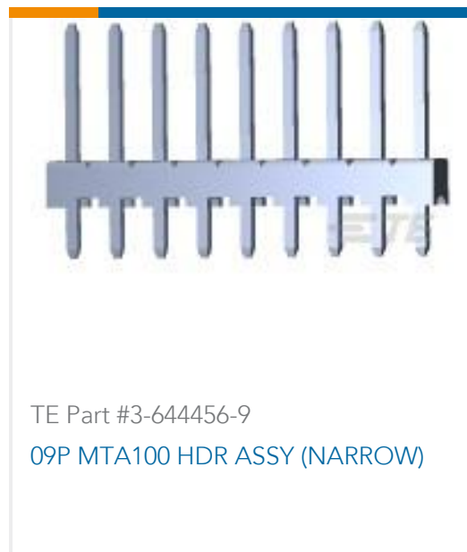
TE Part #3-644456-9 09P MTA100 HDR ASSY (NARROW)