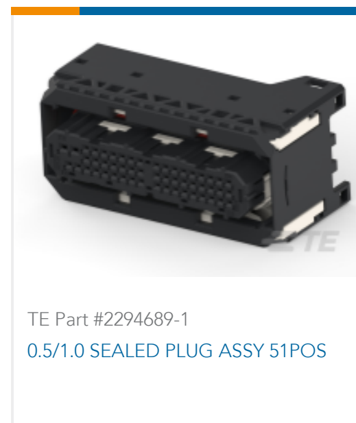
TE Part #2294689-1 0.5/1.0 SEALED PLUG ASSY 51POS