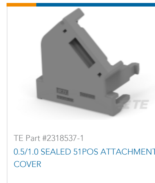
TE Part #2318537-1 0.5/1.0 SEALED 51POS ATTACHMENT COVER