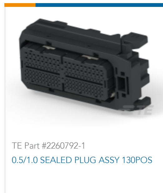
TE Part #2260792-1 0.5/1.0 SEALED PLUG ASSY 130POS