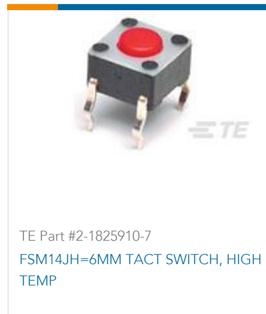
TE Part #2-1825910-7 FSM14JH=6MM TACT SWITCH, HIGH TEMP