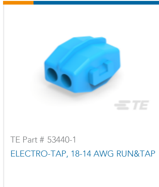
TE Part # 53440-1 ELECTRO-TAP, 18-14 AWG RUN&TAP