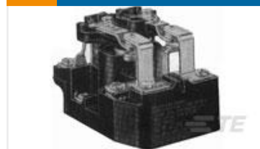
TE Part #1-1393127-2 PRD-11AG0-240=PRD