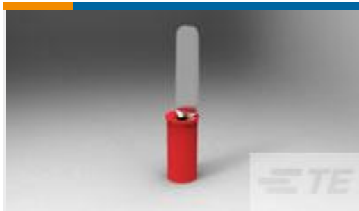
TE Part #34294 TAB,PIDG 22-16