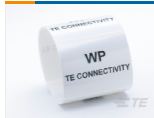
TE Part #D54063-000 WP White Polyester Labels