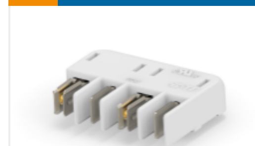
TE Part #2213616-2 HERM BLADE & RECPT,4 POS,POST, SEL GOLD