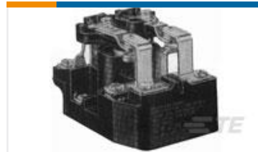
TE Part #1393127-9 PRD-11AG0-120=PRD