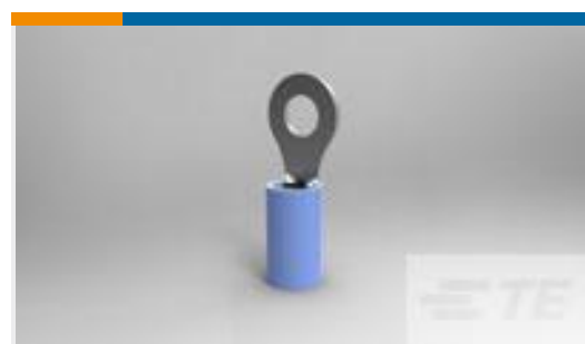
TE Part #53941-1 TERMINAL,PIDG R 16-14 8