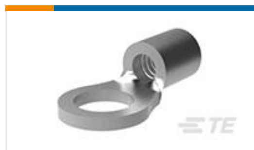
TE Part #322454 TERMINAL,SOLIS R 12-10 8