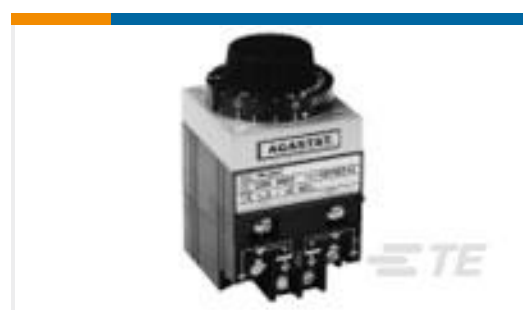
TE Part #2-1423162-9 7022BK=RLY,STD,OFF,M2P,240VAC,