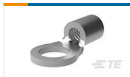
TE Part #8-322454-2 TERMINAL,SOLIS R 12-10 8