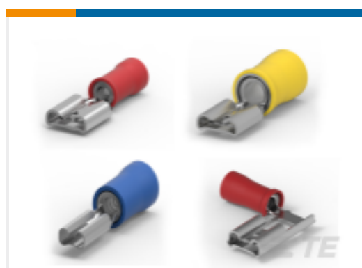
TE Part # CAT-P592-F266 PIDG FASTON Receptacle Quick Disconnects