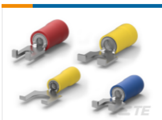
TE Part # CAT-P592-F614 PIDG Flanged Spade Tongue Terminals