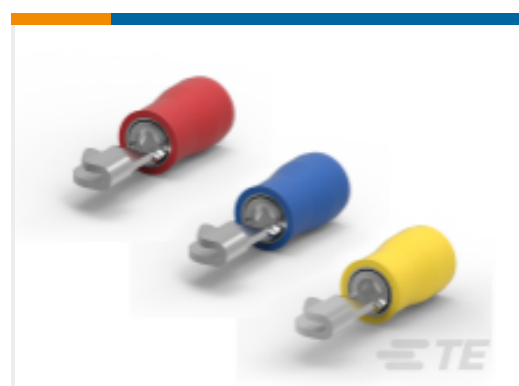
TE Part # CAT-P592-K742 PIDG Knife Disconnect Splices