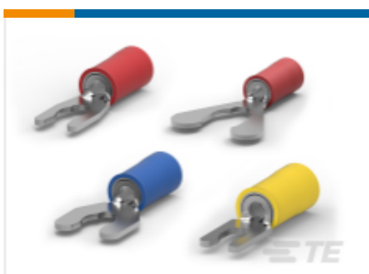
TE Part # CAT-P592-SH816 PIDG Short Spring Spade Tongue Terminals