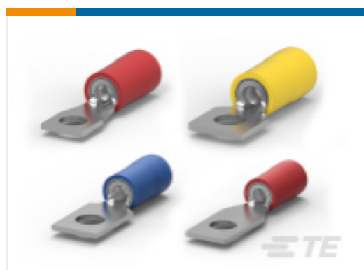
TE Part # CAT-P592-R2456 PIDG Rectangular Tongue Terminals