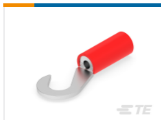
TE Part # 32456 PIDG HK 22-16 COMM 22-18 MIL 8