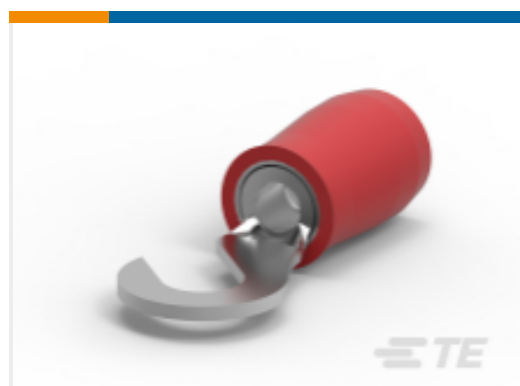
TE Part # 34313 PIDG HK 22-16 COMM 22-18 MIL 6