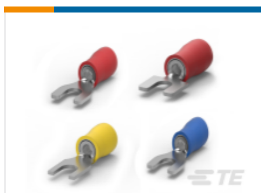
TE Part # CAT-P592-SP118 PIDG Spade Tongue Terminals