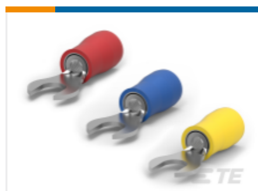
TE Part # CAT-P592-SL56 PIDG Slotted Ring Tongue Terminals