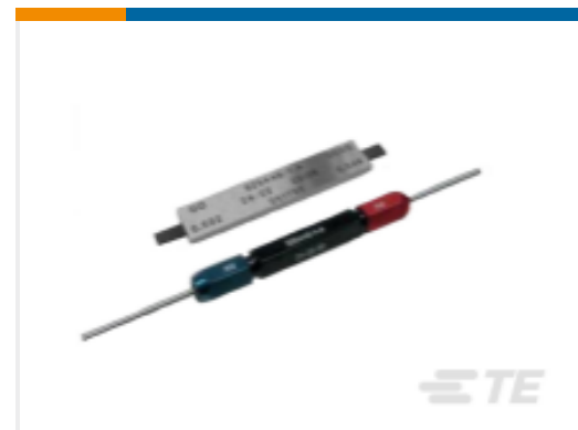
TE Part #525441-5 PLUG GAUGE, HANDTOOL