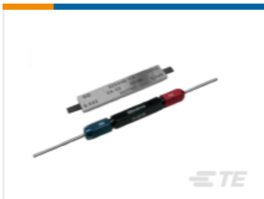
TE Part #1-525441-6 PLUG GAUGE, HANDTOOL