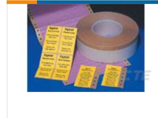
TE Part #707830-000 NPVF050BE-100