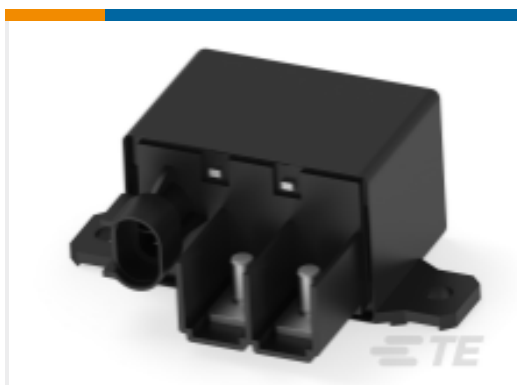
TE Part #2-1414939-2 V23132A2001B200-EV-USBX