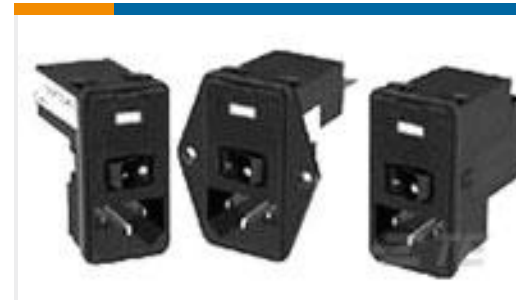
TE Part #2-6609107-0 PS0SXSS60=C1048