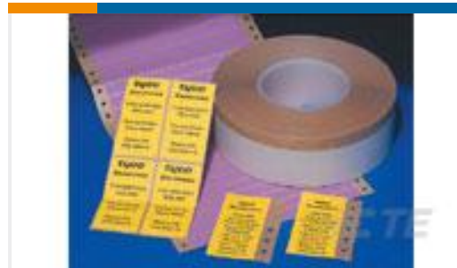
TE Part #097370-000 TTVF200YW-100