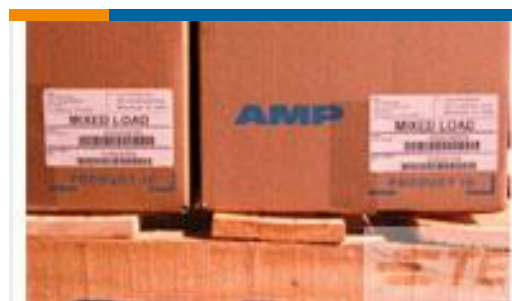
TE Part #D57376-000 EP-508318-2.5-9