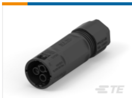
TE Part #1-2379237-1 NECTOR T, INLINE SOCKET, SCREW, Key-A,S2