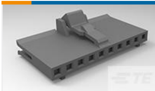
TE Part #1-487526-4 015 HOUSING FFC RCPT 100CL SR