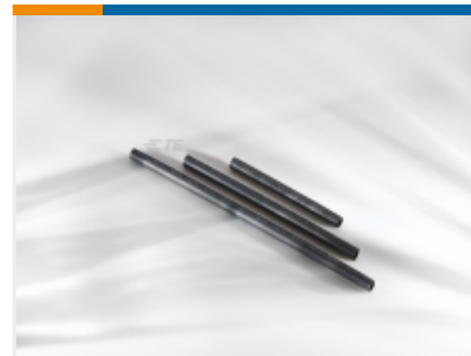
TE Part #607381P046 SCT-NO.2-E5-0-STK