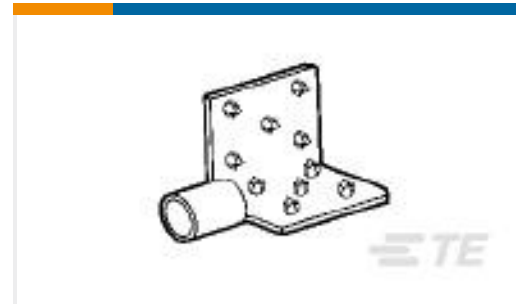
TE Part #329860 TERMINAL,TERMI-FOIL 16-14