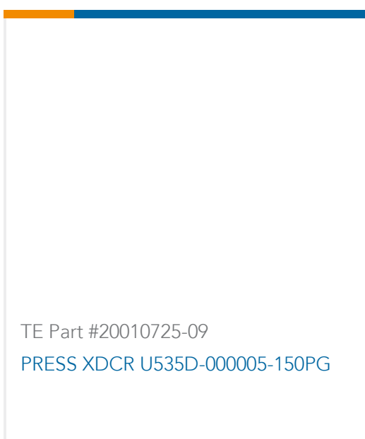
TE Part #20010725-09 PRESS XDCR U535D-000005-150PG