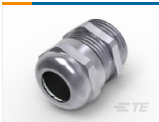
TE Part #T3609200122-000 DLX-20-MB