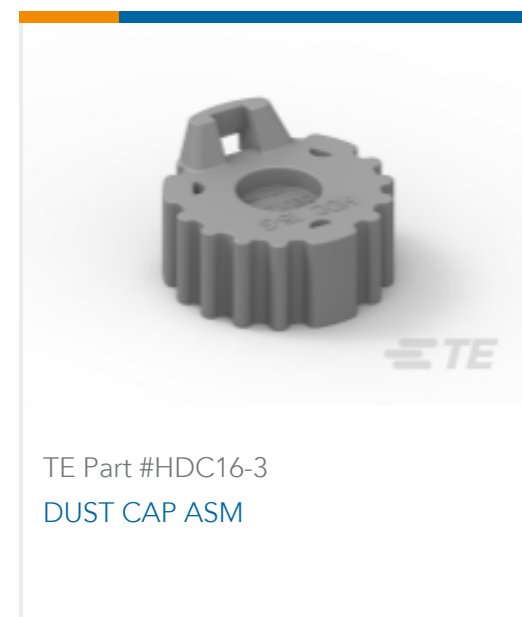
TE Part #HDC16-3 DUST CAP ASM