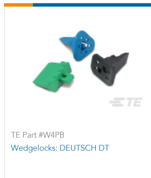
TE Part #W4PB Wedgelocks: DEUTSCH DT