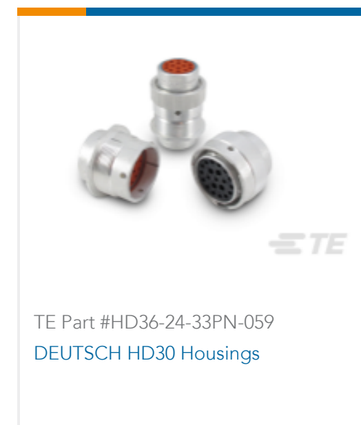
TE Part #HD36-24-33PN-059 DEUTSCH HD30 Housings