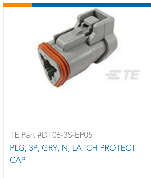
TE Part #DT06-3S-EP05 PLG, 3P, GRY, N, LATCH PROTECT CAP