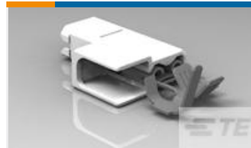
TE Part #521597-2 ULTRA-POD 187 ASY REC 18-14 TPBR