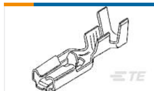
TE Part #63119-1 POSITIVE LOCK 250 REC 22-18 AWG TPBR