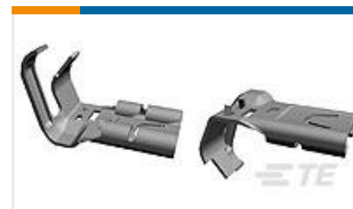
TE Part #63604-1 250 FASTON FLAG REC 18-12 AWG NPST