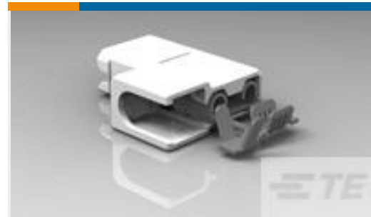
TE Part #521411-2 ULTRA-POD 250 ASY REC 22-18 AWG TPBR