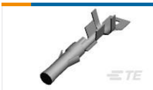
TE Part #770529-1 .093 COMM P&S SOK 14-20 PTPBR