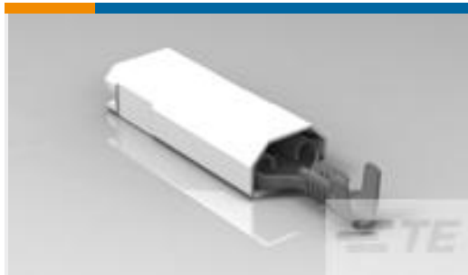
TE Part #521368-2 ULTRA-POD 250 ASSY REC 22-18 AWG TPBR