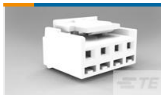
TE Part #2132781-7 07P EP-II HOUSING, NATURAL