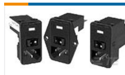
TE Part #2-6609106-6 PS0SXDH60=C1149