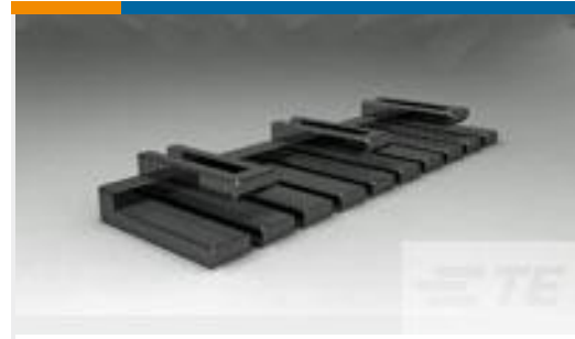
TE Part #1969443-6 EP 2.5 TPA Retainer, 6 Pos