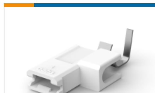
TE Part #521411-2 ULTRA POD: Flag, Receptacle Assembly, Tin Plated, .250 inch