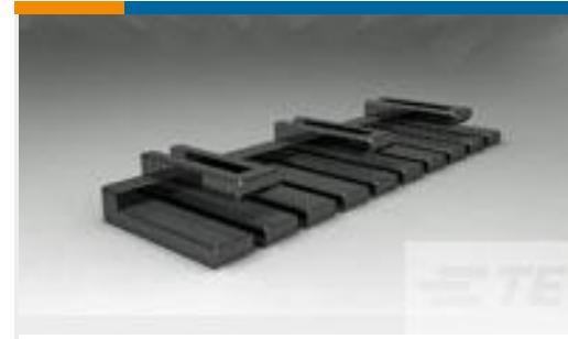
TE Part #1-1969443-0 EP 2.5 TPA Retainer, 10 Pos