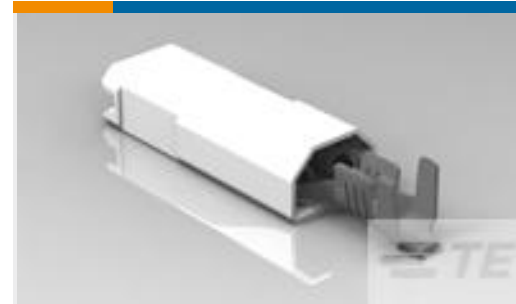
TE Part #521284-1 ULTRA-POD 187 ASSY REC 20-16 AWG BR