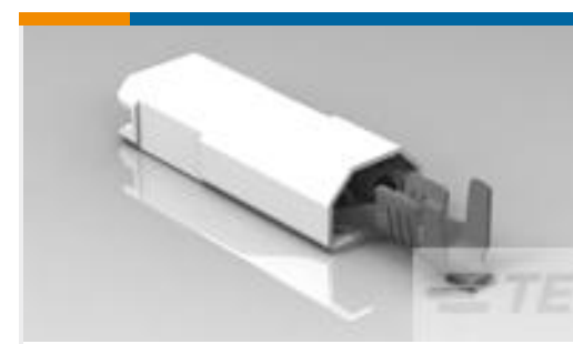
TE Part #521284-2 ULTRA-POD 187 ASSY REC 20-16 AWG TPBR