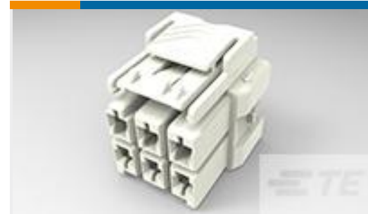
TE Part #1-1971776-3 PTL 2X3 PLUG HSG STD TEMP KEY A NAT