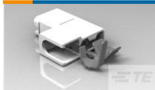
TE Part #521633-2 ULTRA-POD 250 ASY REC 18-14 AWG TPBR