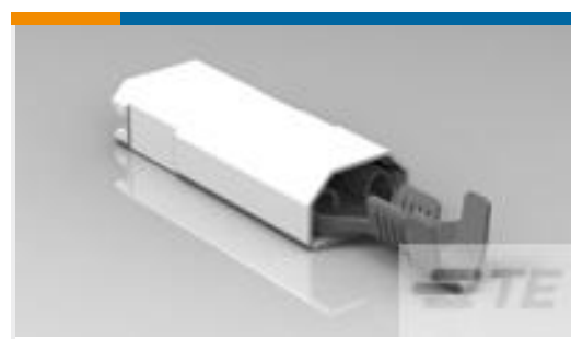
TE Part #521367-2 ULTRA-POD 250 ASSY REC 18-14 AWG TPBR