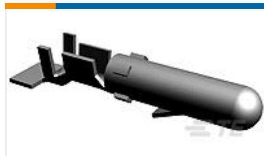
TE Part #61086-1 .156 MNL PIN 20-14 PTPBR