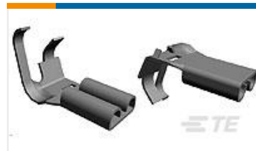
TE Part #62591-1 187 FASTON FLAG REC 20-16 AWG TPBR