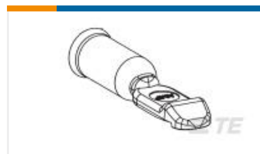
TE Part #647878-1 SERIES 50 & 75 CONTACT, 8 AWG