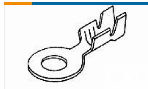
TE Part #42722-1 RING TONGUE 12-10 AWG BR