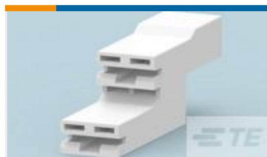
TE Part #521955-1 PL MKIII 250 REC HSG 2P NYLON NAT