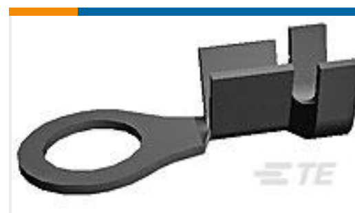
TE Part #41711 RING TERMINAL 22-18 AWG TPBR