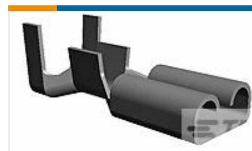
TE Part #42452-1 187 FASTON REC 20-16 AWG BR