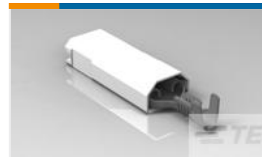
TE Part #520988-1 ULTRA-POD 250 ASSY REC 22-18 AWG BR