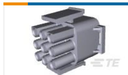
TE Part #794537-1 09P UMNL PLUG HSG 150C BLK