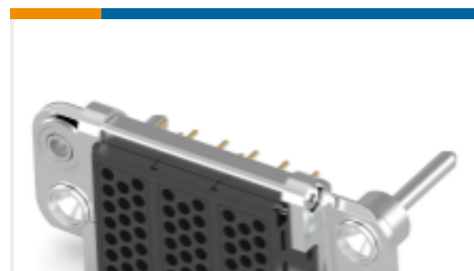
TE Part #6766070-1 CONNECTOR, PIN, DOMINO