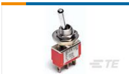
TE Part #4-1825136-9 A101SYZQ04