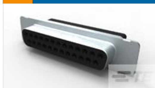
TE Part #5205207-1 HD RECPT ASSY SIZE 3