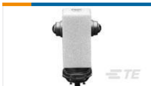
TE Part #7-1618278-8 KC-38/12VDC=RELAY, PRESSURIZED