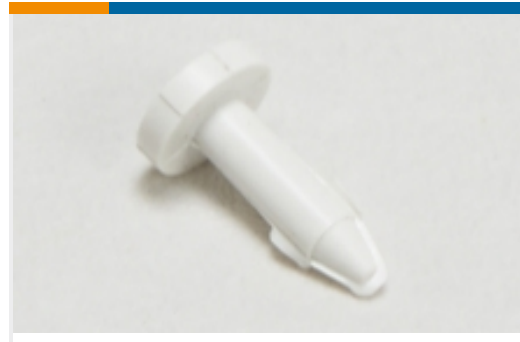
D-Sub Contact Accessories(1)