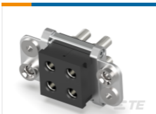
TE Part #2204625-1 CONNECTOR, SOCKET, DOMINO