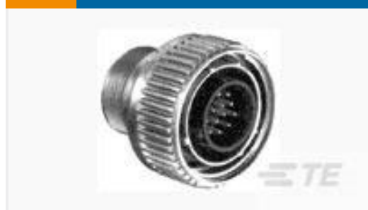
TE Part #208472-1 CMC PLUG ASSEMBLY,SZ 28