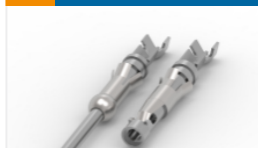
TE Part #66182-1 Pin and Socket Contacts, Type III, LP