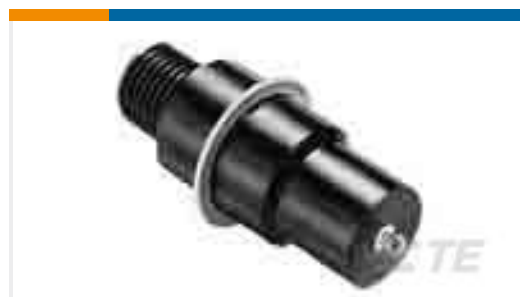
TE Part #1-5849587-9 RECEPTACLE